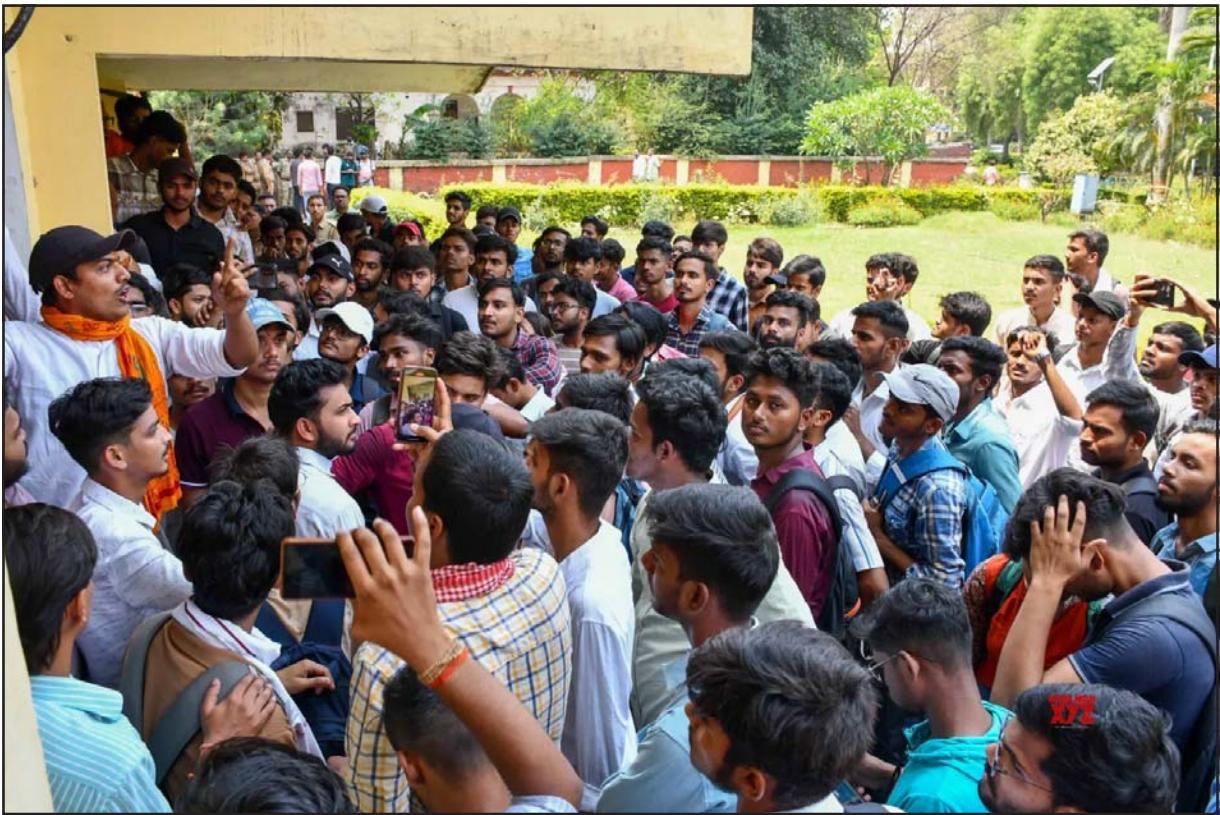
Prayagraj: Students protest over the drowning death of a fellow student at Ewing Christian College in Prayagraj on Thursday, April 17, 2025.

On Wednesday, following a two-hour-long hearing, the apex court indicated that it may stay certain key provisions of the Act, including the inclusion of non-Muslims in the Central Waqf Council and Waqf Boards, powers of Collectors on deciding disputes over Waqf prop-